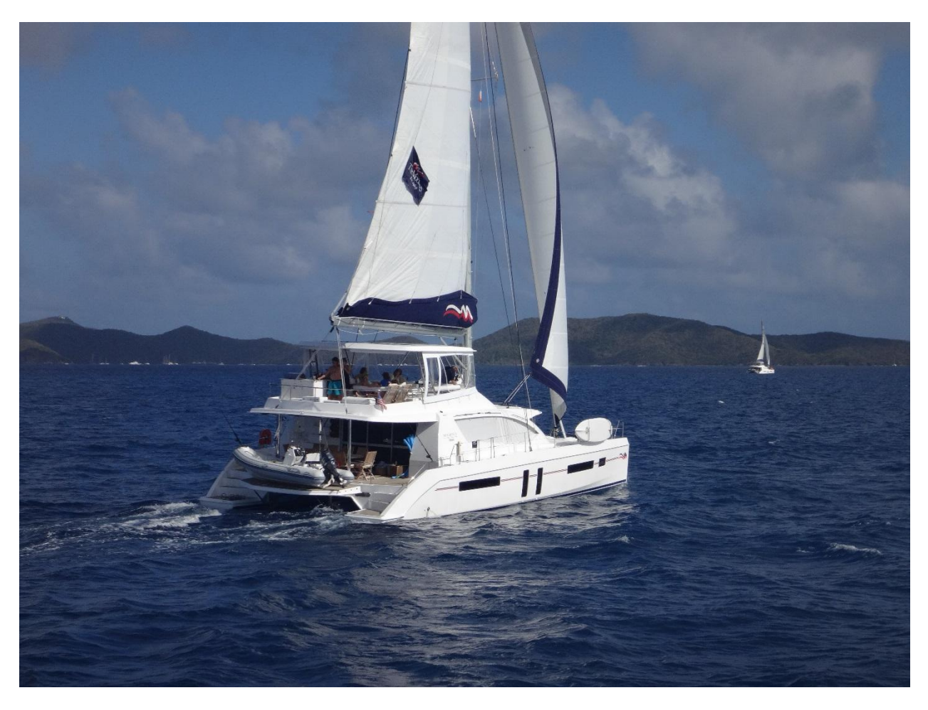
Underway to our first mooring in the Bight, Norman Island