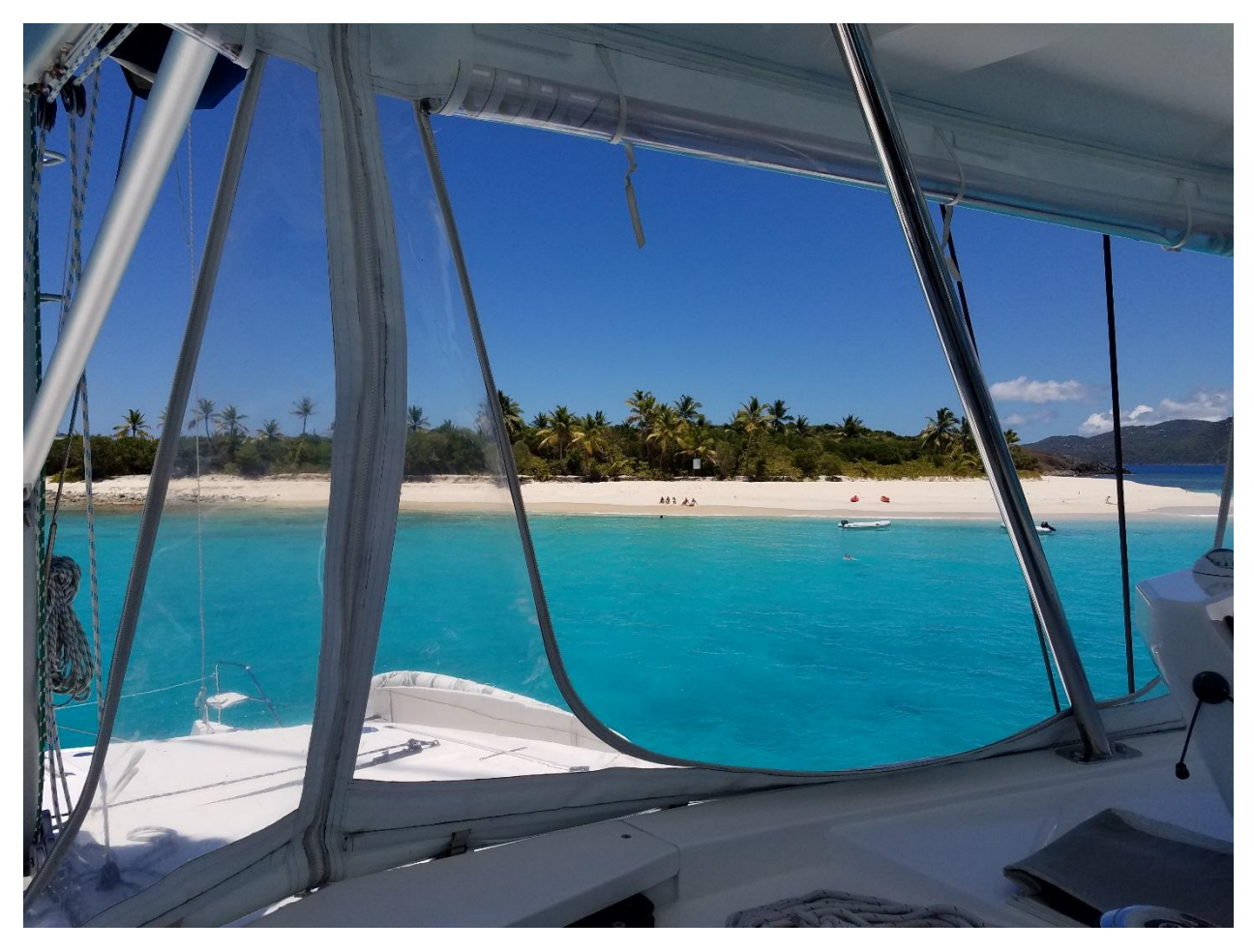
What a view!