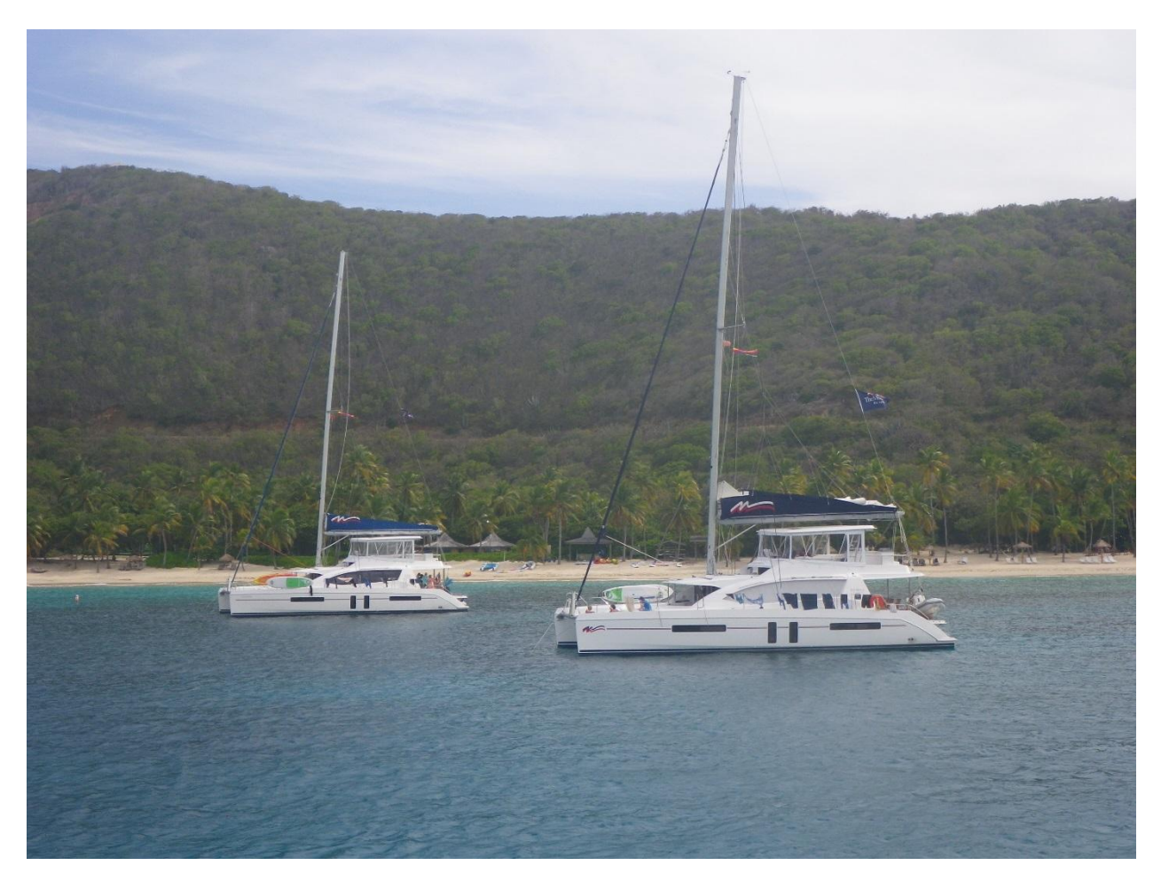
Anchored and ready for playtime.