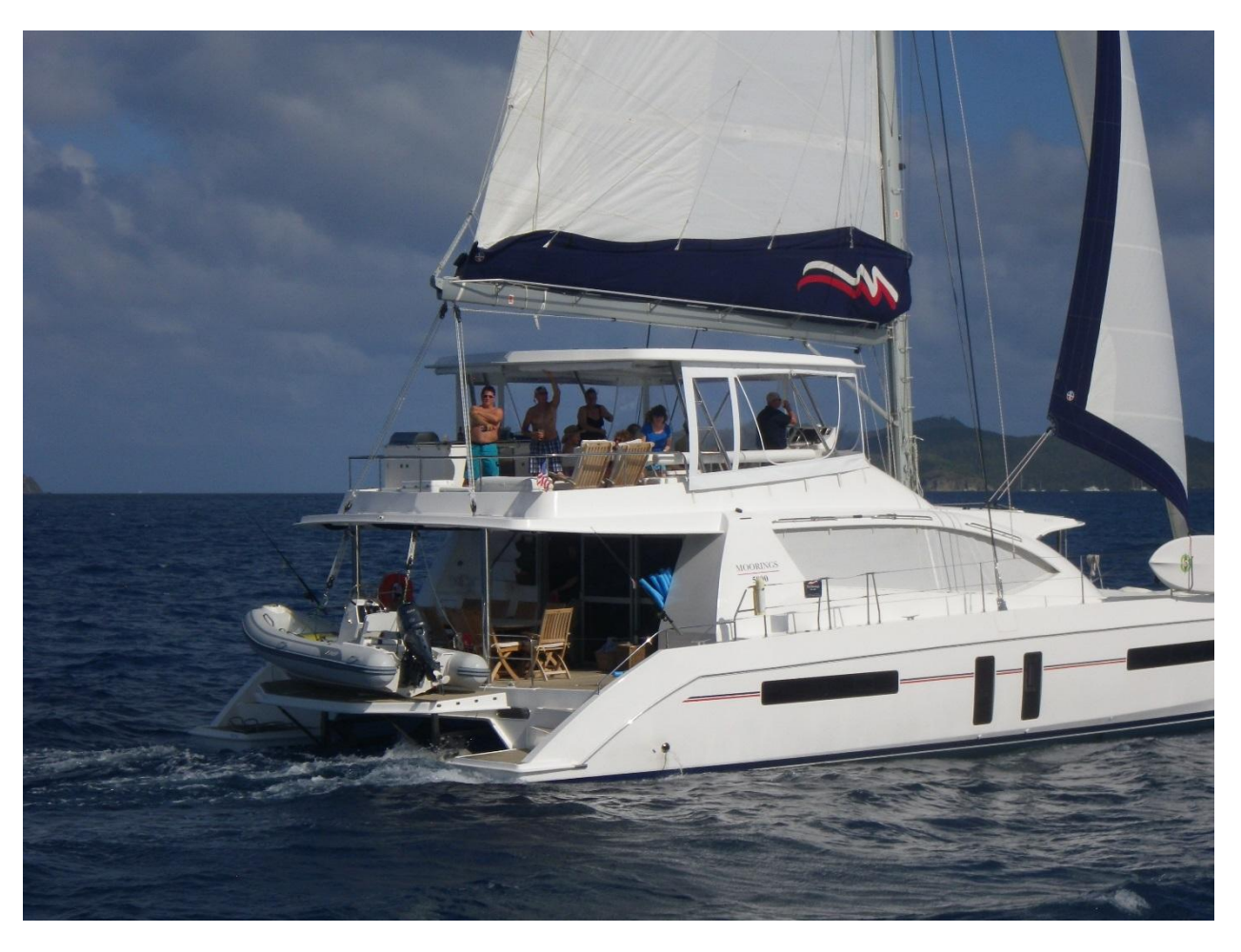
We are underway and so is the party!