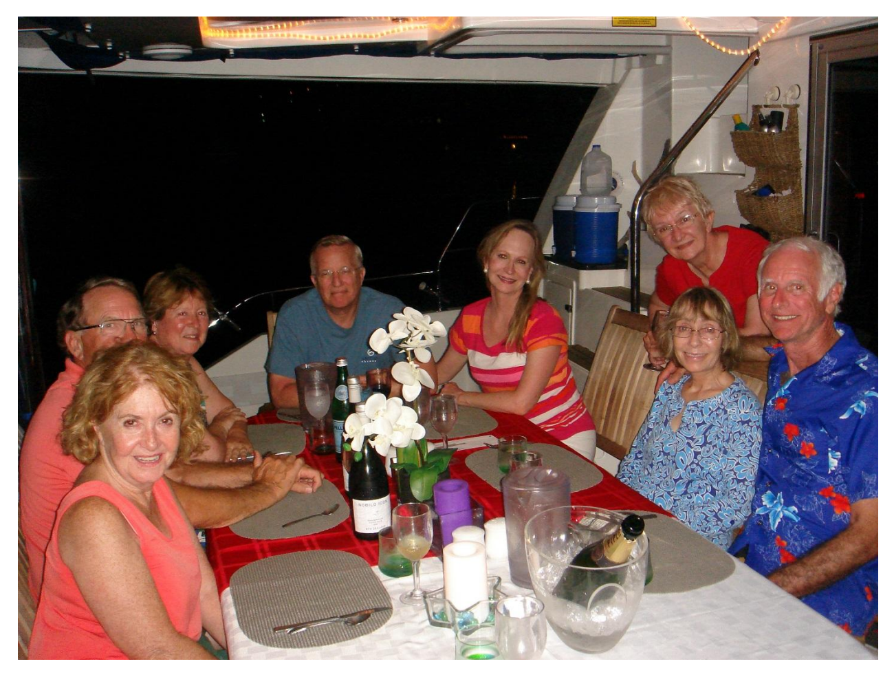
Dining aboard Happy Hours II. The gourmet dinner arrives shortly.