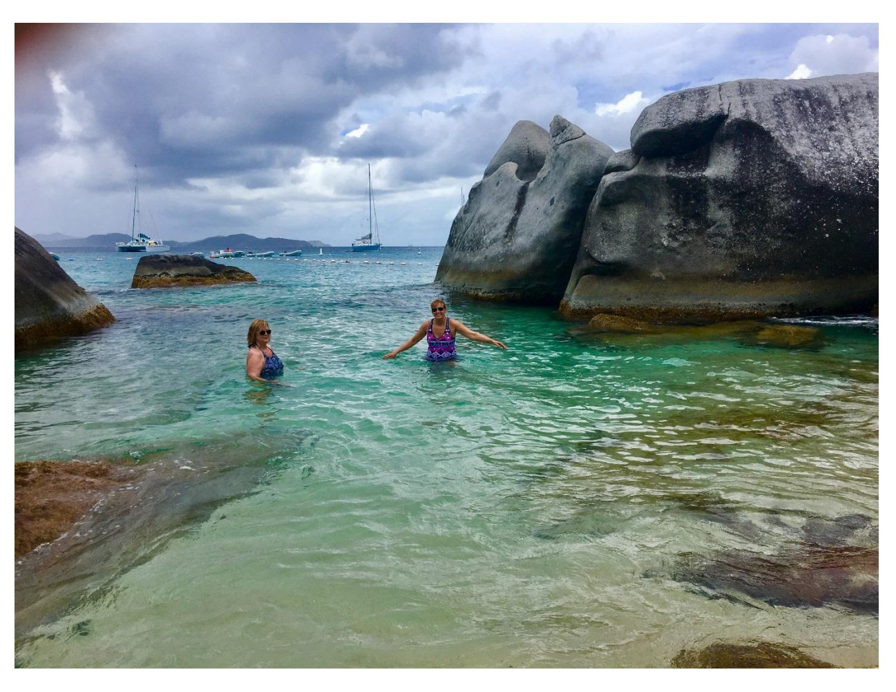
Cooling off at the Baths, Virgin Gorda, BVIs