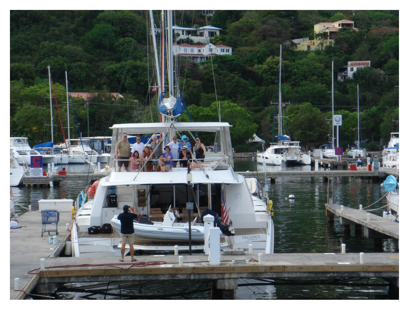
At the dock before departing to our first destination.