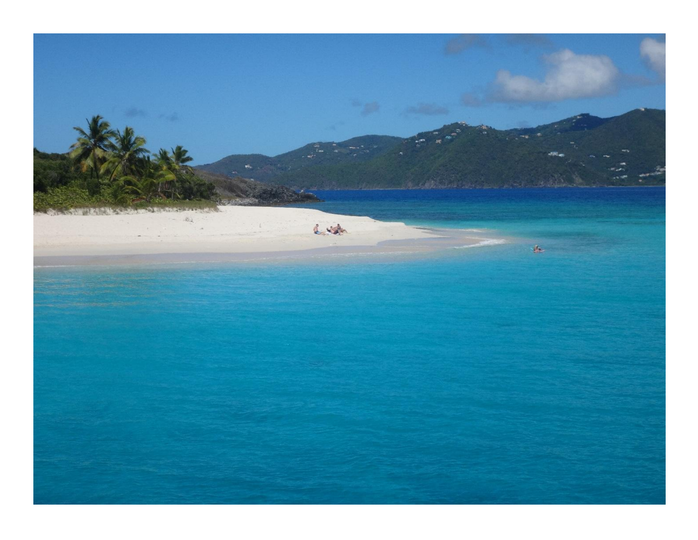
A picture perfect beach in the BVIs